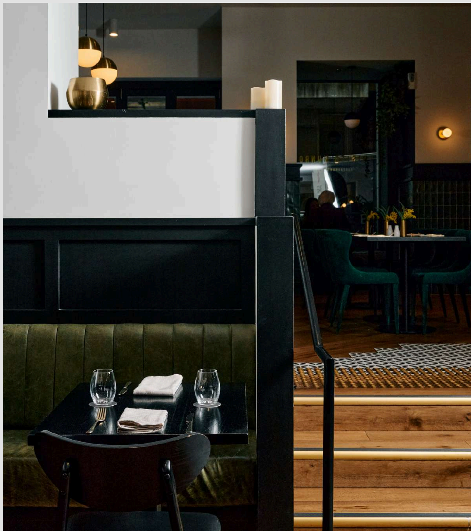
MISTER MUNRO PRIVATE DINING